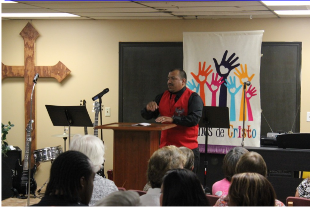
July 15, 2012